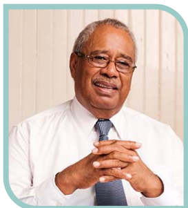
Savenaca Narube Leader of Unity Fiji